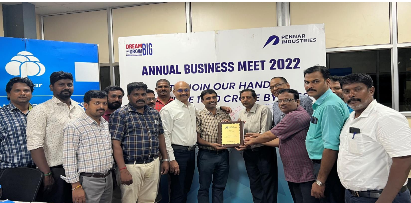
A trophy was presented to Hydraulics team for their outstanding performance in achieving 10 crore revenue for the month of July 2022